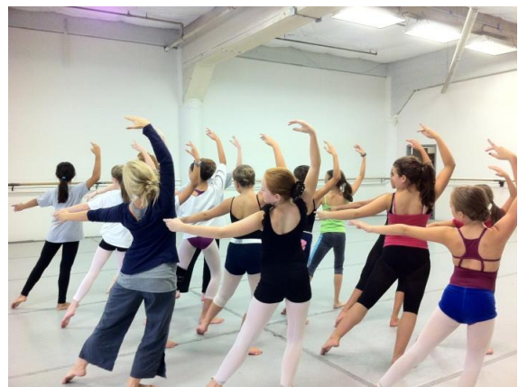
Colorado Ballet Academy Levels 5-6 in modern class