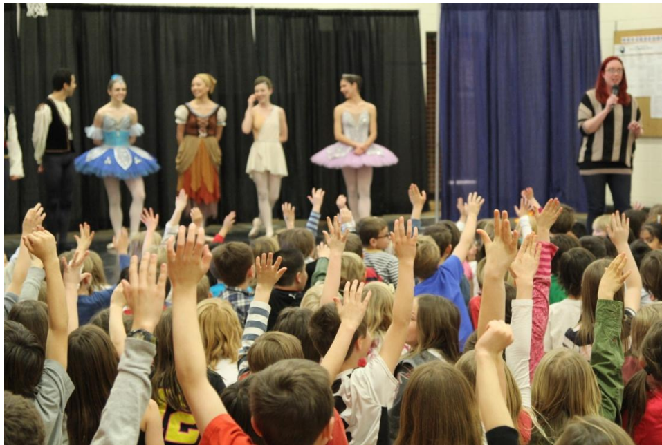
Page to the Stage school assembly