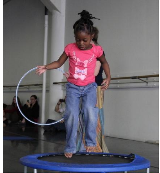
Student in Warren Village dance class

Education & Outreach staff gave presentations at the National Dance Education Organization Annual Conference.