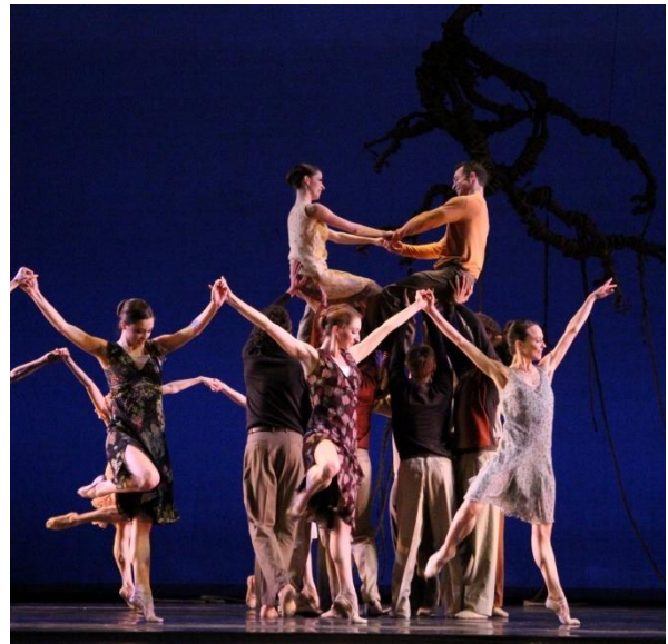
Artists of Colorado Ballet in "Light/The Holocaust & Humanity Project," photo by Colorado Ballet Staff