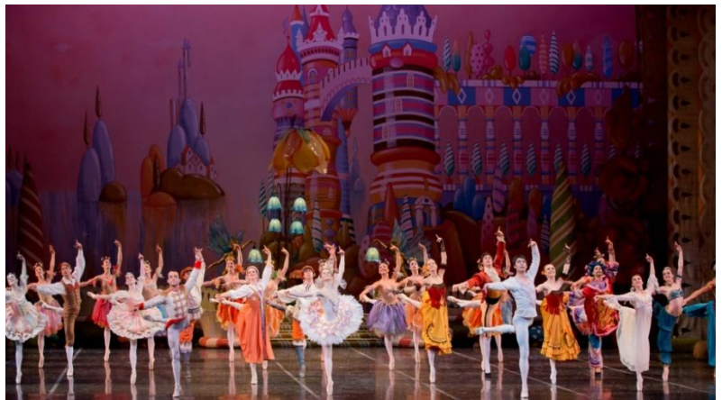
Artists of Colorado Ballet in "The Nutcracker," photo by Mike Watson