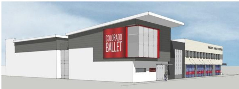
Building sketch of Colorado Ballet's new home