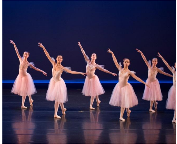
Colorado Ballet Academy students in Winter Showcase

Colorado Ballet's Department of Education & Outreach makes more than 60,000 contacts each year and serves in-need students, teachers, families, people with disabilities and lifelong learners in Colorado. In 2012-2013, Education & Outreach began integrating Be Beautiful Be Yourself students into the Academy schedule and Showcase performances. The department continued its partnership with Rhythm and Grace Program for adults with Parkinson's Disease. Education & Outreach was in its ninth year of a partnership with Warren Village, offering dance classes for preschoolers. Warren Village helps motivated low-income, previously homeless