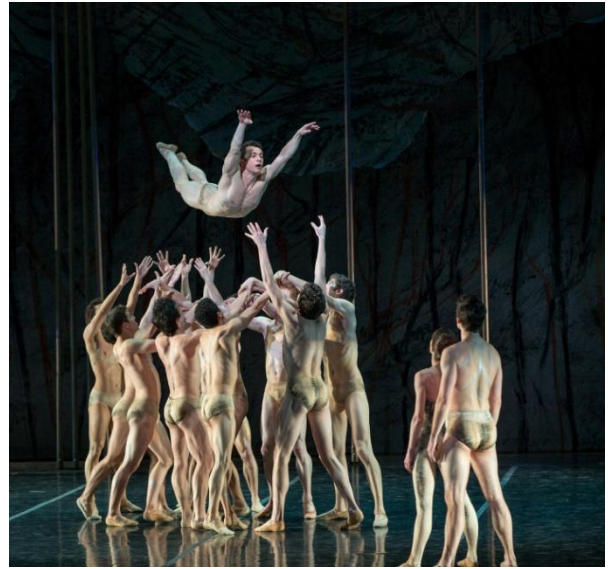
Artists of Colorado Ballet in "The Rite of Spring" in "Ballet MasterWorks,"

Light was not just a performance, it served as the centerpiece of a community outreach program. This community education partnership promoted the protection of human rights through arts, education and public dialogue. Light/The Holocaust & Humanity Project started around Martin Luther King Jr. Day in January and ran through Holocaust Remembrance Week in mid-April. The education partnership featured events and initiatives led by more than 100 community partners. Governor John Hickenlooper and Mayor Michael B. Hancock served as Honorary Chairs.